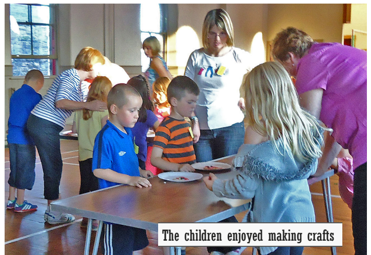
The children enjoyed making crafts

What is not to like about putting to use wonderful facilities that have been lovingly restored. Church Halls were formerly a National School. We also have a Social Outreach Centre built by PCUSA, and the multi-unit Townsend Enterprise Park. Wonderful gifts.