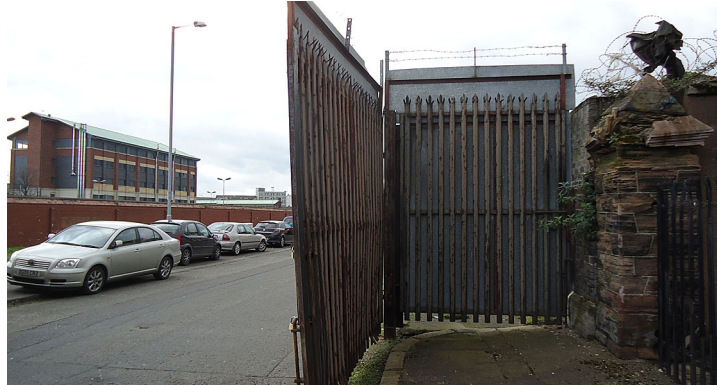
Townsend Street peace gate at wall of church. BMC Millfield in background.