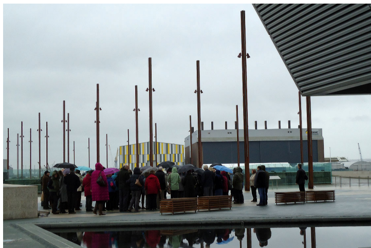
The chilly Dock Walk at the bow end of the Titanic slipway on 26 January