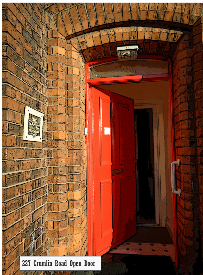
227 Crumlin Road Open Door

Visitor Centre. They were able to meet the Sisters from Workman Avenue and many others.